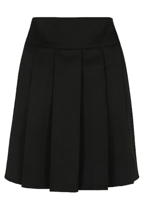
Black tailored skirt (tube style skirts are not permitted)