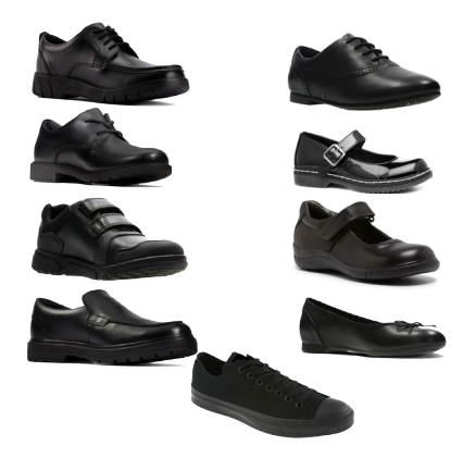
Plain black shoes (if laced must be black laces, no logos or markings)