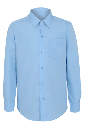
Light blue shirt (white for Years 10 & 11)

All other garments below can be purchased from any retailer provided they are in line with the descriptions below.