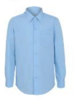
Light blue shirt (white for Years 10 & 11)

All other garments below can be purchased from any retailer provided they are in line with the descriptions below.