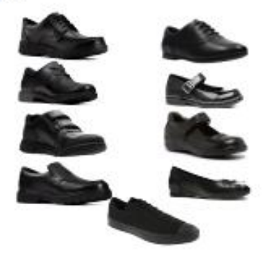
Plain black shoes (if laced must be black laces, no logos or markings)