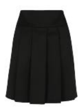
Black tailored skirt (tube style skirts are not permitted)