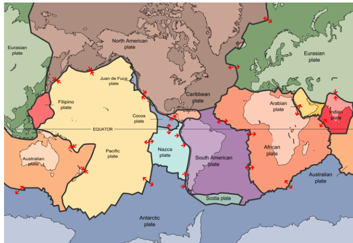
Plate tectonics is the theory that Earth's outer shell is divided into several plates that glide over the mantle, the rocky inner layer above the core. The plates act like a hard and rigid shell compared to Earth's mantle.